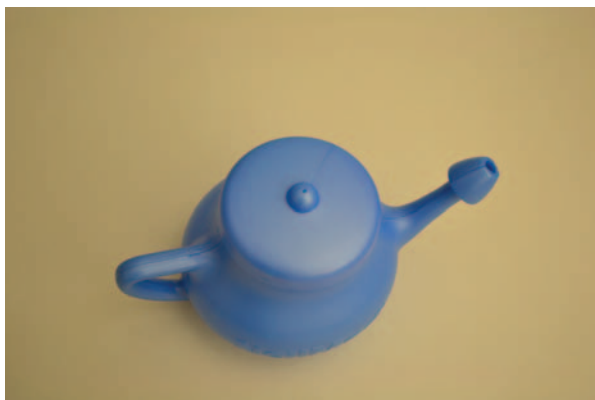
Figure 1. Neti pot.

plumbing, subsequently lowering the thermostat to about 120° F to reduce the risk of scalding. To reduce the risk of recolonization, the occupants were further advised to repeat this procedure every few weeks.